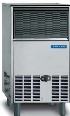
B 5022 AS/WS

Bar Line Equipment range is the newly released EU made ice makers for Thimble-shaped rounded ice cubes coming from Bar Line.