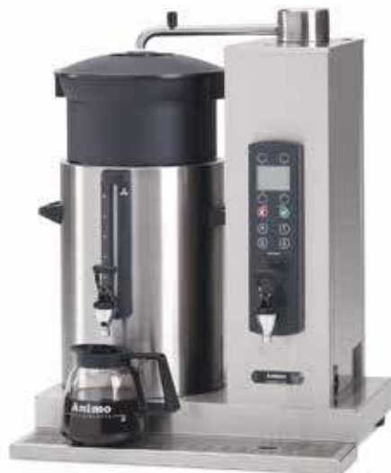
+ ComBi-line with a 10 litres container on the left side and a separate water boiler in the unit: CB 1x10W L.