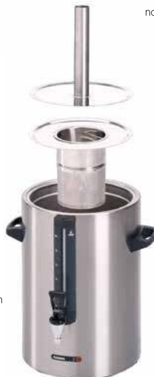
+ For making tea in a container, place the special tea filter with filler pipe.

Tea can be made just as easily with the same machine. A special tea filter with filler pipe is available for this. No tea leaves in the tea and no used tea bags to be cleared away. Perfect.