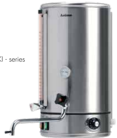
WKI - series