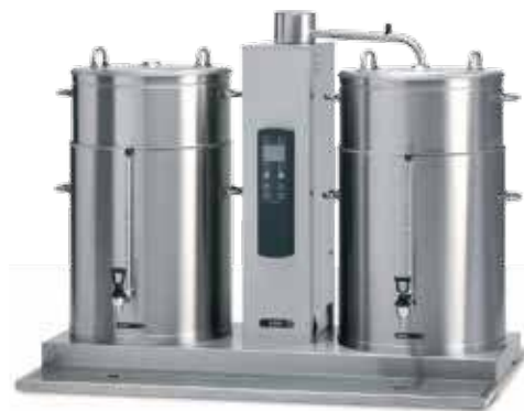
+ CB 2X40

+ The containers are available in 5, 10 and 20 litres. Containers with the same volume can be stacked.