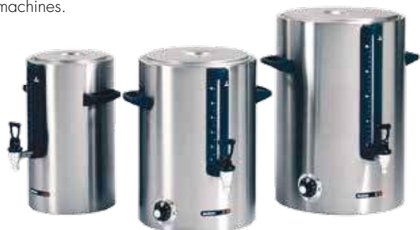
WKTD - series

WKTD storage water boilers have a double walled, stainless steel housing. The safe polyurethane insulation prevents the outside from becoming hot. The lid has been insulated as well. The WKTD water boilers have a gauge glass, a non-drip tap and an adjustable thermostat as standard. Available in 5, 10 and 20 litre models, with (VA) or without (HA) fixed water connection, they are a perfect combination with the ComBi-line coffee-making machines.