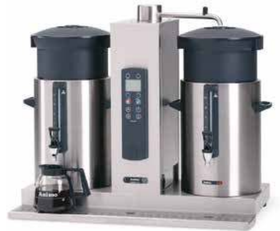
+ ComBi-line with two 10 litre containers: CB 2x10

ComBi-line machines offer the possibility of making large quantities of coffee and tea in a short time. A ComBi-line set-up is a combination of one or two continuous flow water heaters and one or two containers. The containers can be placed on a buffet, counter or serving trolley. The largest machine has a capacity of up to 1280 cups (160 litres) per hour.