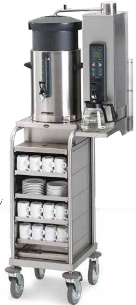
+ Serving trolley CB 10W

Animo also has an appropriate range of serving trolleys. Ask your supplier for the brochure.